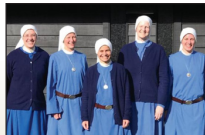
Sisters of the Society of Mary